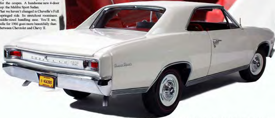
Chevelle Super Sport 396 Coupe with Strato Bucket Seats and console you can order - See lots more. Turn the page . . .