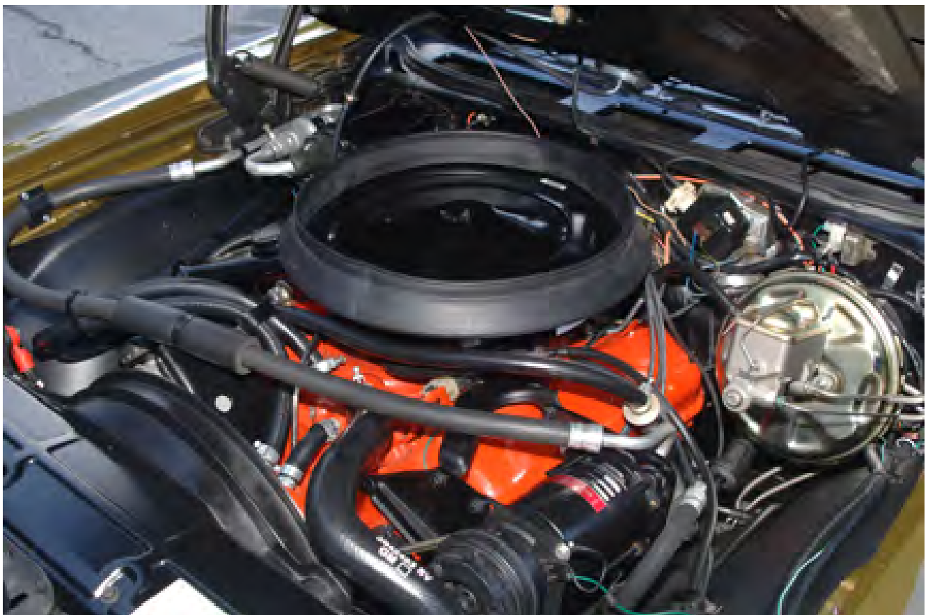
1972 LS5 454

In conclusion, if you are looking to purchase a true Chevelle SS and it is 1969 or newer, I can only keep repeating the same thing... documentation, Documentation, DOCUMENTATION!!!