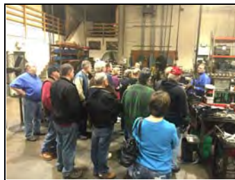
Pretty good turnout