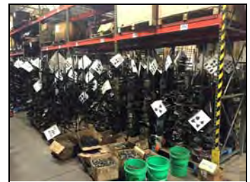
Pump reservoirs with ID sheets