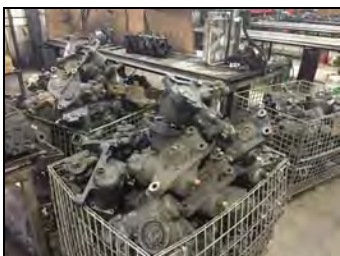
Cores come in by shipping container, get cleaned and ID'd, then disassembled. Once done, they're boxed and ready to ship.