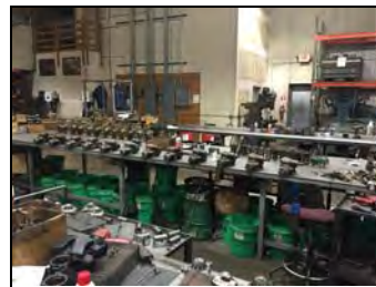
Assembly line layout for speed