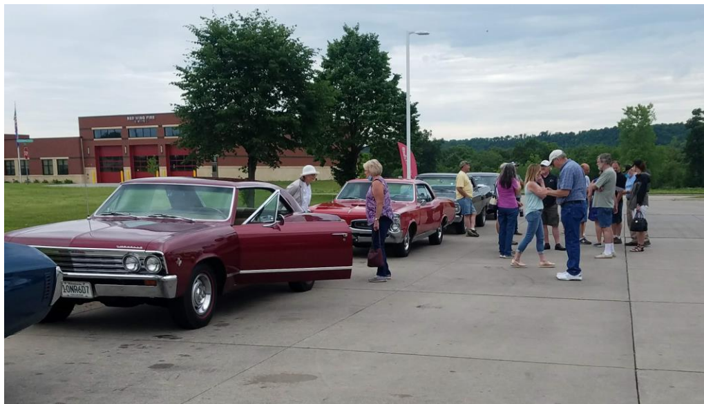
A Quick Stop on The Way