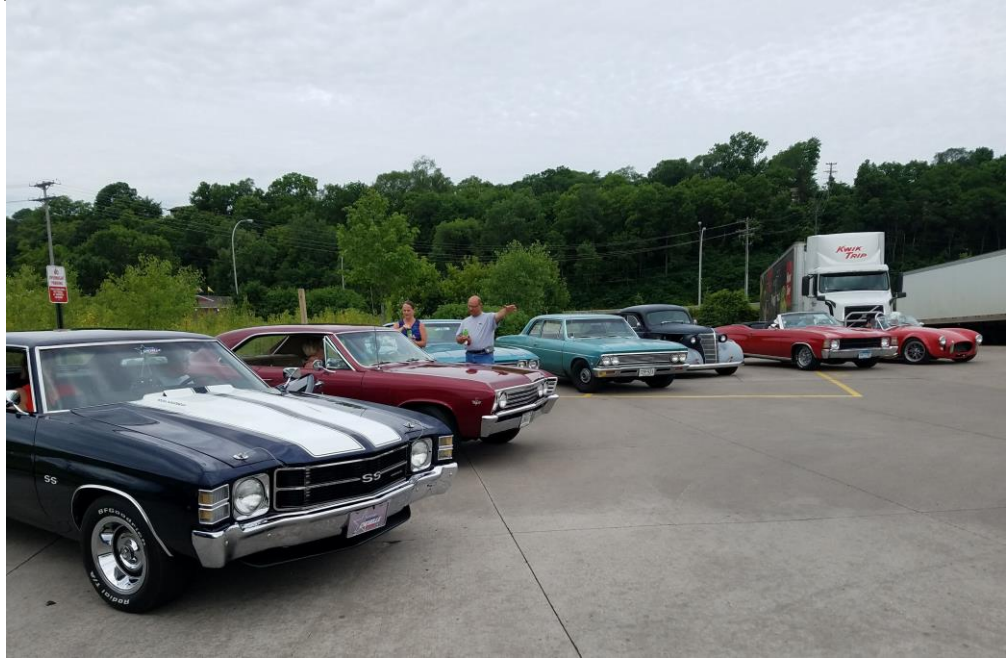
Meeting at the Starting Point