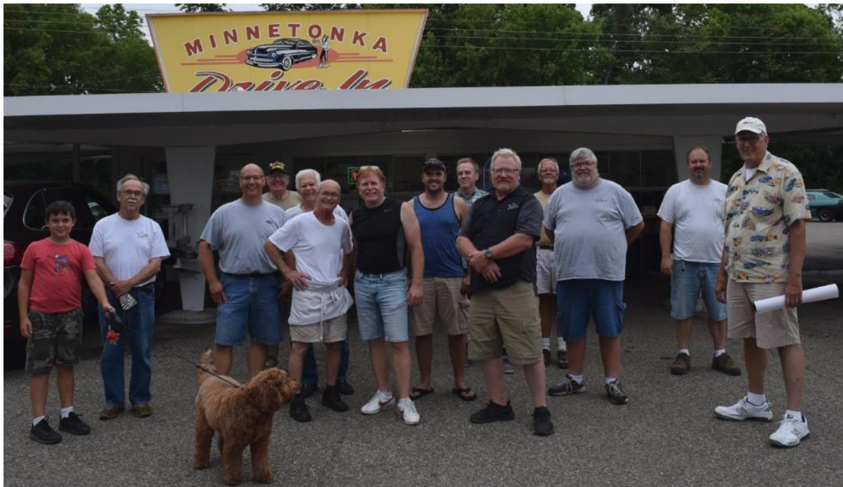
Club Members at the Drive-In