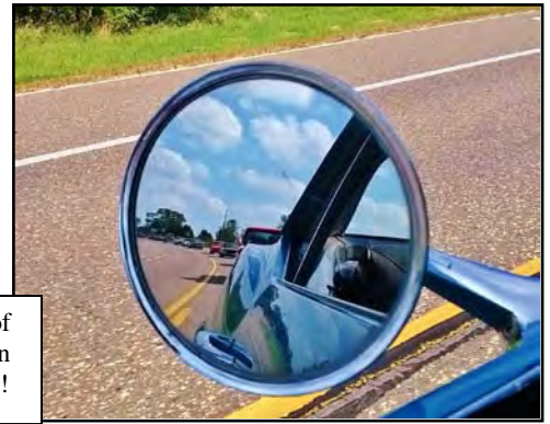
Taken While driving!

Fall is here, and you know what that means.... Get those last cruises in; enjoy your rides before they go into hibernation. We had some great weather this summer; hopefully we'll have an easy winter and an early spring. Looking back over the summer, we've had some new members join, and seen others move. One thing remains unchanged: our members have fun together. We're to that point of the year where our officers will need to be nominated and voted upon by our membership. Please do your best to attend the next couple meetings and support your club. We need our volunteer leaders to help arrange meetings, and guide the group.